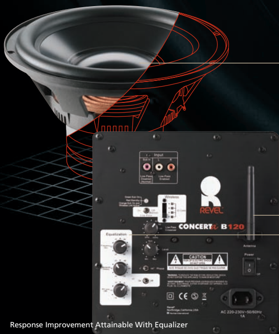
Response Improvement Attainable With Equalizer

The B120 cabinet is constructed of rigid MDF with extensive internal bracing to reduce cabinet-induced colorations. A downward-firing port allows for placement against a wall or in a cabinet. Rubber-padded feet ensure optimal stability on any floor surface.